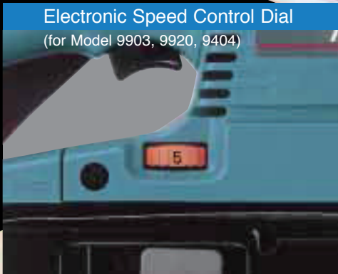
Electronic Speed Control Dial (for Model 9903, 9920, 9404)

Electronic variable speed control dial allows you to match speed to job.