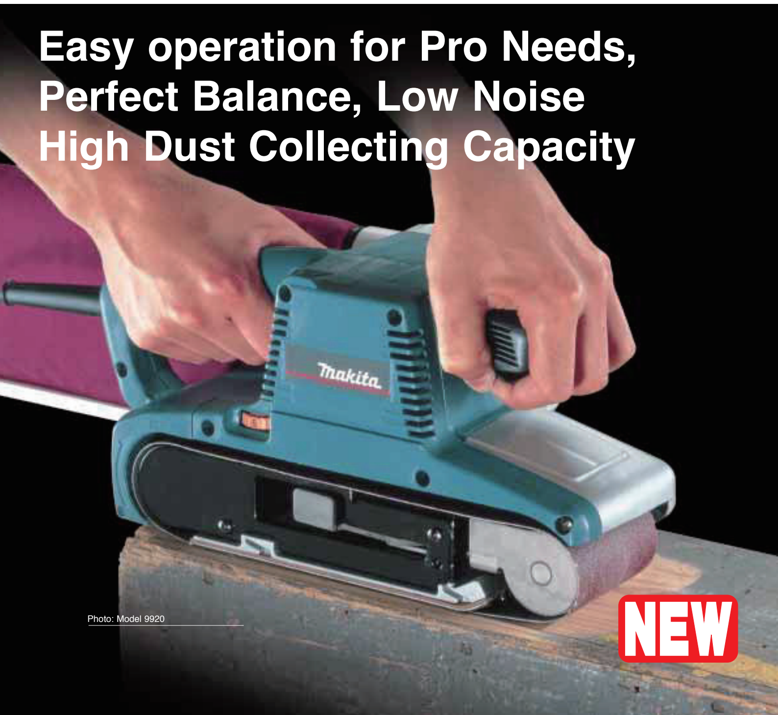
Photo: Model 9920

Easy operation for Pro Needs, Perfect Balance, Low Noise High Dust Collecting Capacity