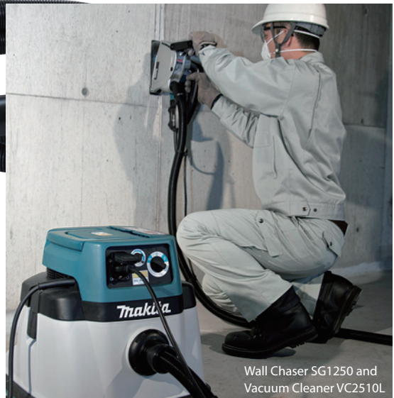
Wall Chaser SG1250 and Vacuum Cleaner VC2510L