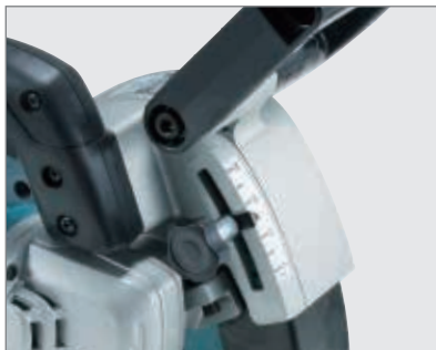
Adjustable cutting depth