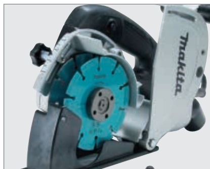
Aluminum blade case designed to allow for easy blade replacement