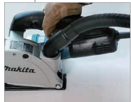
Connectable to vacuum cleaners for clean work environment