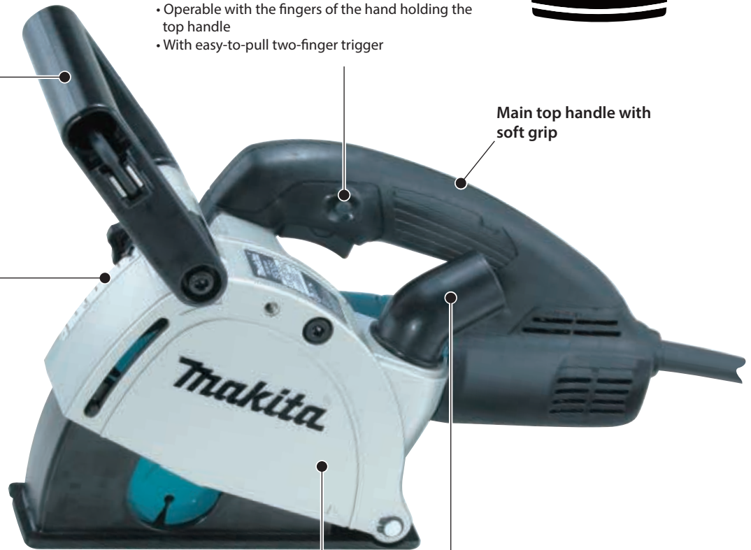
Main top handle with soft grip