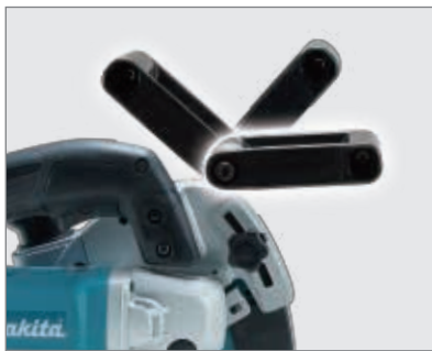
Ergonomically designed front handle